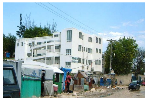
A Secondary Private Hospital in PauP.