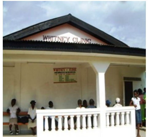
A primary clinic in Hinche.

Cap-Haitien. The team also toured the public Hôpital Universitaire La Paix (HoP—Hospital of Peace in PauP) and met with senior MoH officials. The following observations were made: