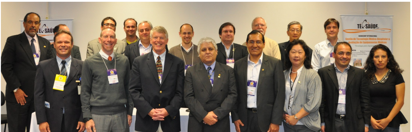
Florianópolis Brazil ACEW Workshop Faculty and Invited Speakers