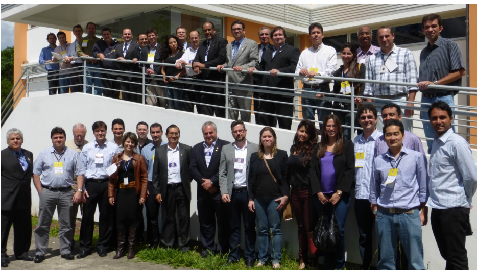
Group photo with participants in front of IEB-UFSC (Universidade Federal de Santa Catarina)