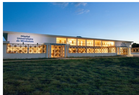
The Hôpital Universitaire de Mirebalais (HUM) is a Tertiary Public Hospital located in Mirebalais.