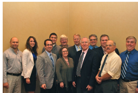
NESCE 2011 Symposium planning committee was responsible for coordinating the event.

Overall, the symposium was a huge success and the society looks forward to hosting its next symposium in 2014.