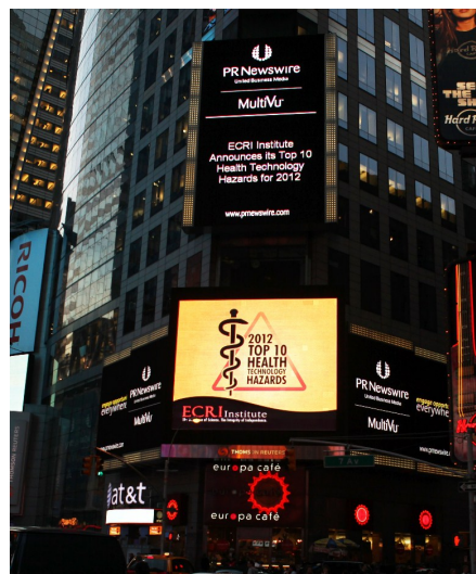
ECRI Top 10 on Times Square JumboTron as posted by PRNewswire.

Our Top Ten lists have been among the most frequently referenced and high profile ECRI Institute content. The new Top Ten list has already been covered by a number of prominent news outlets and publications including Modern Healthcare, the Boston Globe, CMIO News, The Sacramento Bee, Outpatient Surgery, Medcity News; DotMed, and PRNewswire, which amazingly posted information about our list to its Times Square Jumbo-Tron (see below).