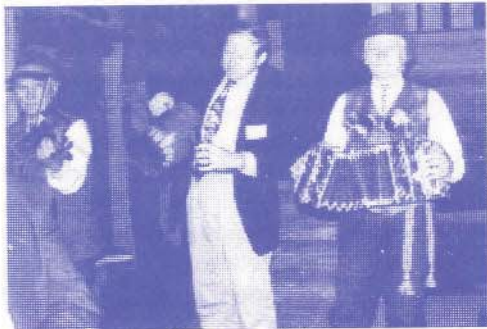
Dyro pours a libation

Social functions included a reception following the first day co-hosted by BaltMedTech and ACEW. In the evening of the second day, the faculty and delegates dined at a traditional Lithuanian folk restaurant where entertainment included musicians and waiters and waitresses in native costume.