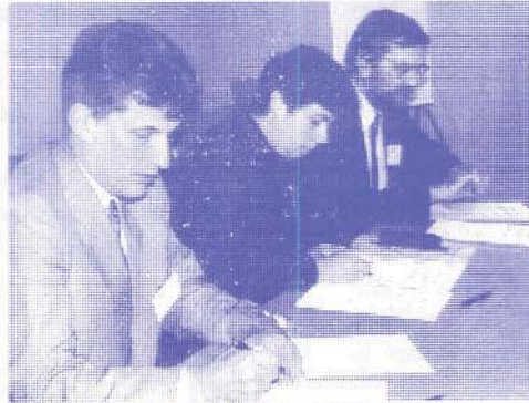
Latvia, Lithuania and Estonia sign BaltMedTech Agreement