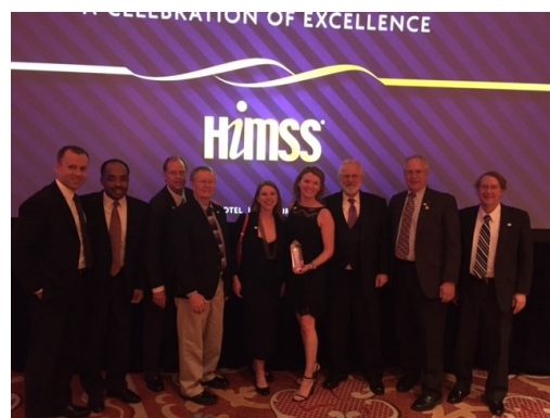
HIMSS Awards Reception