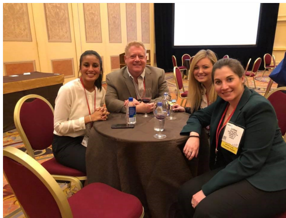
Thank you to the Enlighted team!