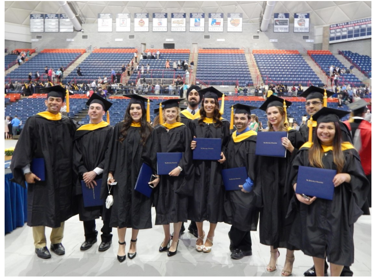
UConn Clinical Engineering Graduates, Class of 2014.