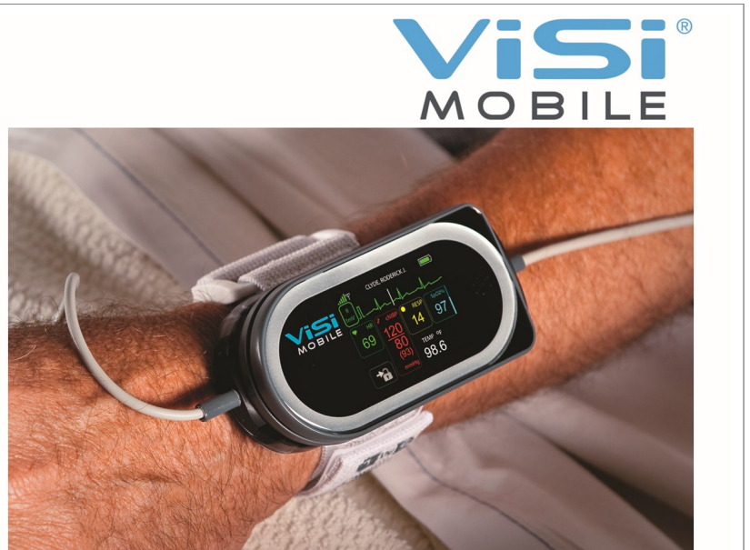
ALL VITAL SIGNS: ECG, Heart/Pulse Rate, Respiration, Blood Pressure, SpO 2 , Temp (Skin)