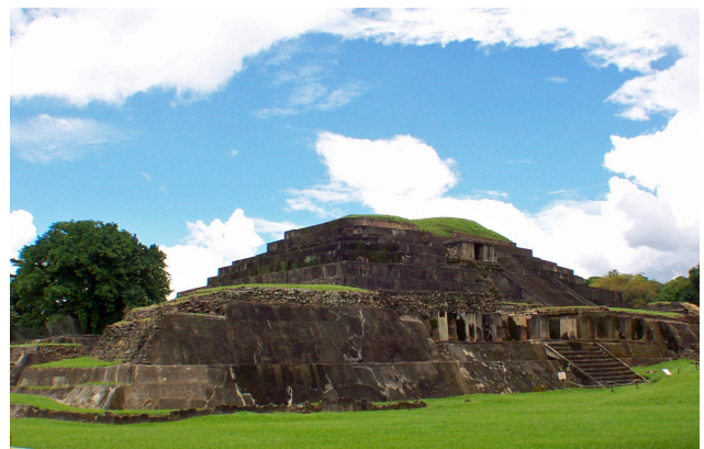
A Mayan temple tour during a break from the ACEW Workshop