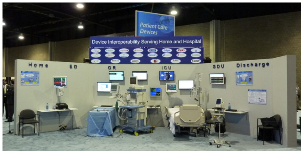
2010 HIMSS IHE Patient Care Devices (PCD) Device Interoperability Display