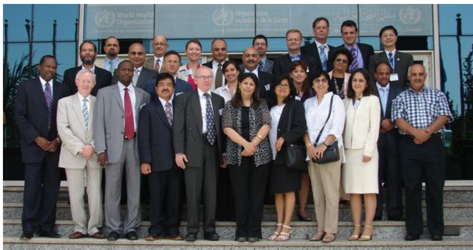
Meeting participants at the entrance to the Eastern Mediterranean Regional Office (EMRO) in Cairo Egypt