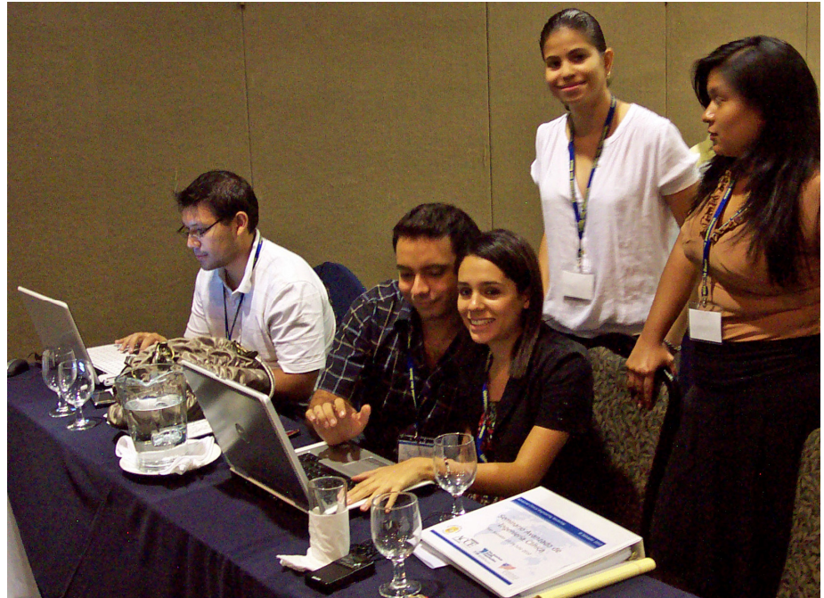
ACEW workshop small group project members collaborate on their classroom project

Topics for the construction track included: the planning and design process; construction risk assessment; sterilization systems; fire safety systems; electrical safety systems; medical gas systems; mechanical systems; emergency manage-