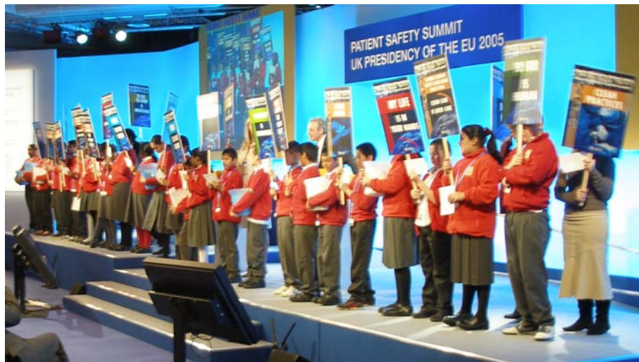
The young people - the 54 countries participating in this program were represented by Children of the World choir.

The opportunity to tell the clinical engineering story was grabbed and the audience was educated. I delivered our specialty's conviction to the participants of the 2005 Summit on Patient Safety. For three days at the end of November beginning of December 2005, policy and decision makers from various healthcare delivery systems from around the world convened at the QE II conference and deliberated on how the world can have safer healthcare delivery services. Every level of the healthcare delivery system was represented, included family members of patients who suffered fatal or bad out-