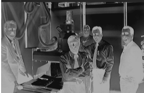
Celebrating Ten Years of Excellence in Training and Support Services