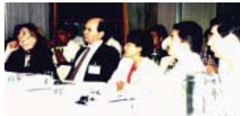
ACEW delegates listen intently

The hard work of the faculty, presenting parallel sessions, enabled more than 230 professionals to participate in the ACEW. Each of five parallel three-hour sessions was attended by 30 participants. The workshop included 50 students in addition to 30 observers in the afternoon session.