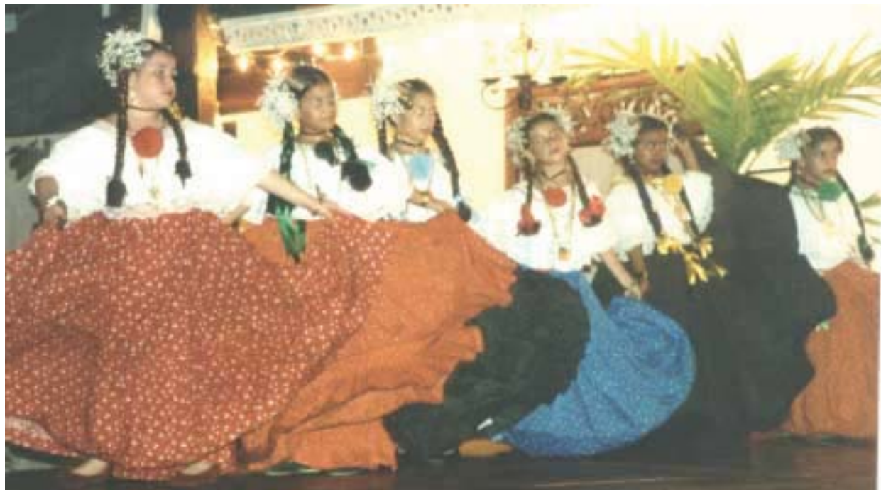
ACEW in Panama, p.6