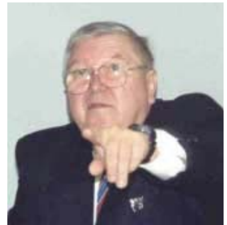
Hey you out there! Yes, you.