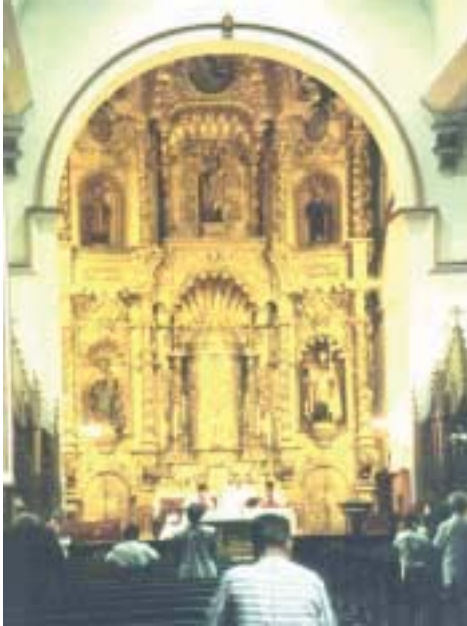
The Church of San Jose

We couldn't get two close to the President's place because of all the security. As you drive in the area, you must keep your headlights off so as not to blind the police.