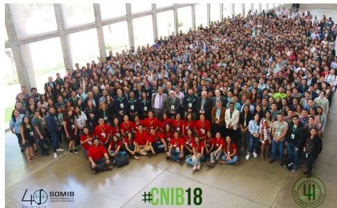
Picture of all speakers and attendees at the 41th National Congress of Biomedical Engineering (CNIB18) with the volunteers wearing red shirts in the front.