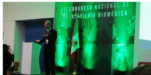
I had the privilege of presenting Evidence-Based Maintenance at the CNIB18.