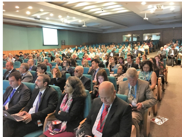
2nd ICEHTMC participants, Hospital Sirio Libanes, Brazil