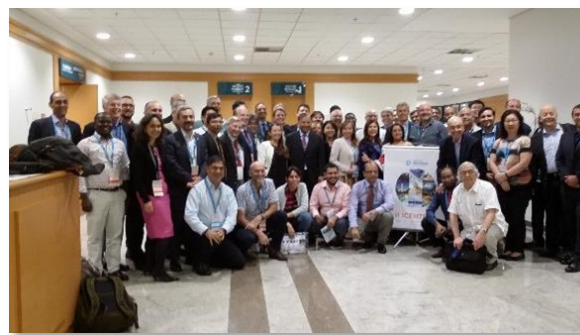
2nd Global CE Summit participants