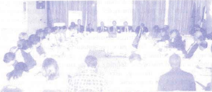
The intimate workshop setting was conducive to lively interaction