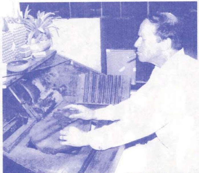
The cultural tour of Santo Domingo observed apprentice cigar rollers learning their craft